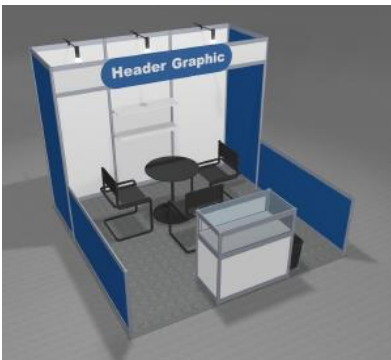
10' x 10'